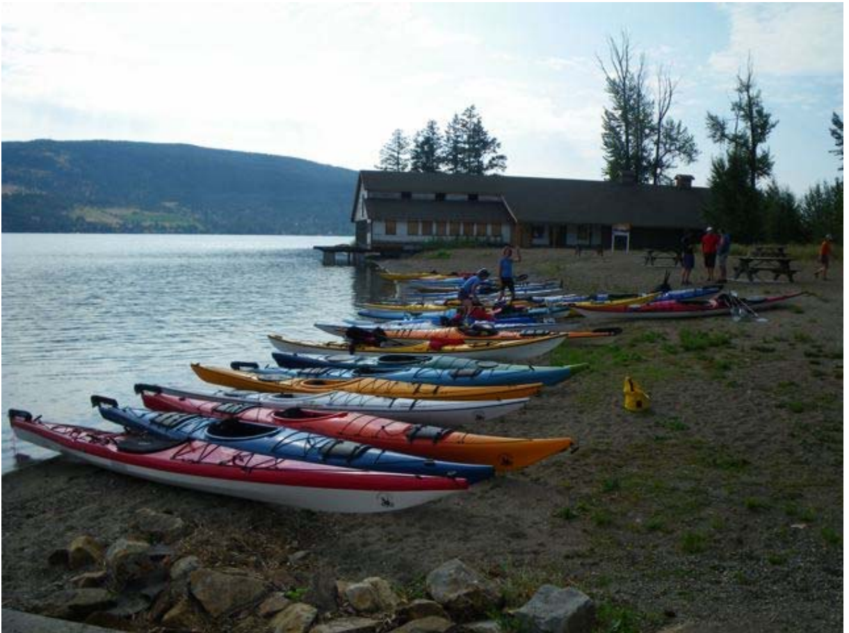
Fintry

Club meetings are held on the second Tuesday of the month at 7:30 at the May Bennett Centre (135 Davie Road).